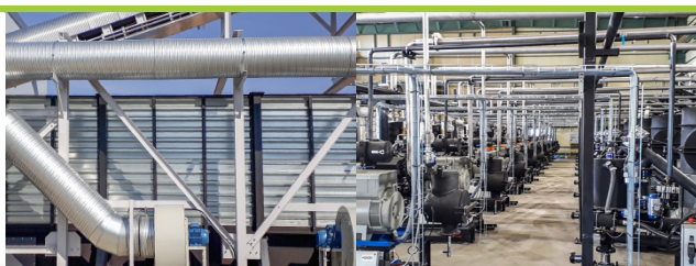
MOVING FLOOR BUNKERS